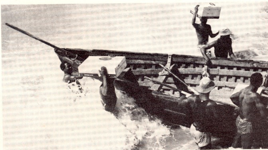
Unloading Emborg frozen quality meat from the world-famous "surf boats" in Accra, Ghana.

In 1958, Emborg agreed that frozen foods could also be carried out