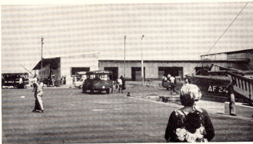
Emborg's cold stores in Tema, Ghana, are located at the harbor, close to the fishing trawlers.