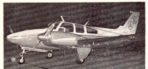
Emborg executives take full advantage of such communication links as the private Beechcraft airplane.

The first cold store was a 1,200 tons cold store in a new industrial area of the capital Accra, which was inaugurated in November, 1959. The partners simultaneously founded Fan Milk Ltd., Ghana, a recombination dairy supplying fresh milk in cartons to the man in the street at prices which suited his pocket, and which