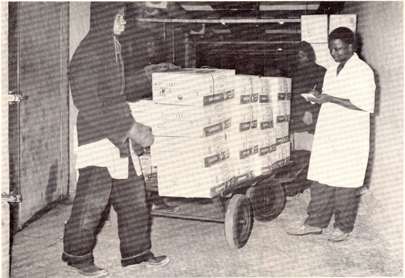
Checking shipments of Emborg's pigs feet in cold store in Nigeria.

EMPRIX – the Annual Danish Packaging Grand Prix – was awarded to the ERIK EMBORG packs in 1963. Another winner by PAKKO-TRYK A/S, Korsoer, Denmark.